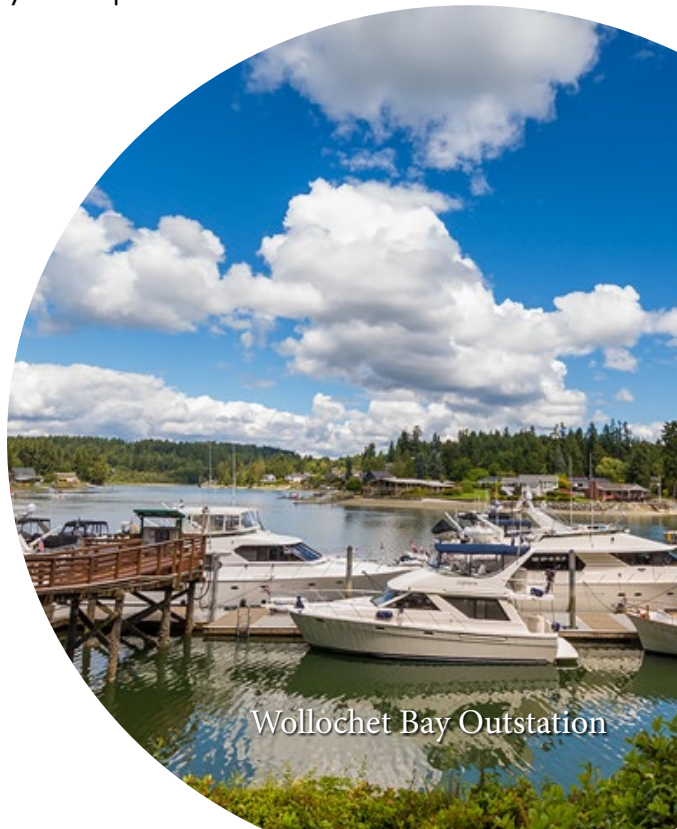
Wollochet Bay Outstation

The club maintains seven outstations for the enjoyment of Active Members. Wollochet Bay in Gig Harbor and Oro Bay on Anderson Island are great weekend getaways. To the south is Swan Town Marina in Olympia with many wonderful places to visit. To the north we have Eagle Harbor, near the City of Bainbridge Island, where you can enjoy shopping, restaurants and galleries. Even farther north is Deer Harbor on Orcas Island. We also have outstations at Dock Street Marina in downtown Tacoma and Cornet Bay in Deception Pass.